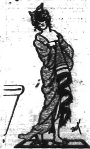
THE "CAMELTA RED."

We have a large selection of Turkish Bath Gowns from No. 15-30.