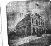
W. M. JOHNS & CO., PROPRIETORS.

The Hotel Oecil is a modern building, built on the site of the old Oecil Hotel, and is one of the best in Mombasa.