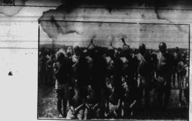
English workers demand for the Cereals Photo.