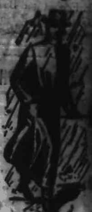
The "Squire" Cycling Capes.

Tennis Balls French and Maragans No. 14-50 per dozen.