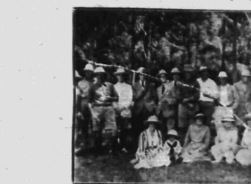
A group taken on the occasion of the Nyati golf tournament, with its Kenyan.