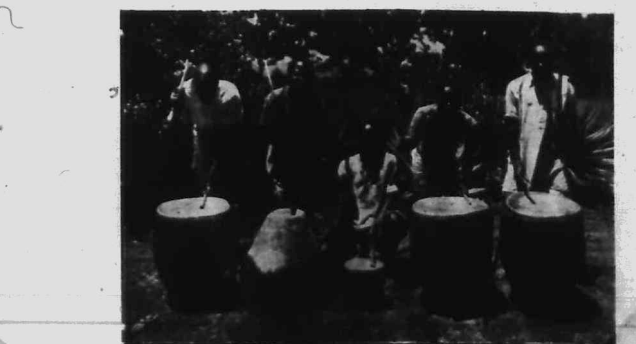
The Police of Nyati.