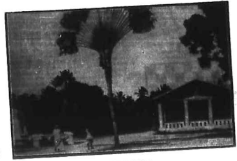
VIEW IN TANGA