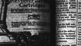
REMINGTON-UNION ARMS CO. Revolver and Cartridge