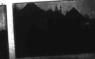
BEDFORD SQUARE TANGA