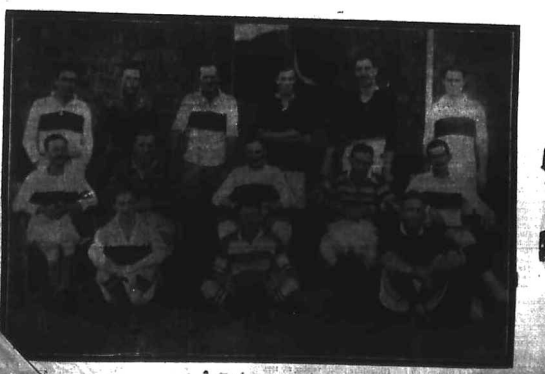
THE NAKURU SIDE.