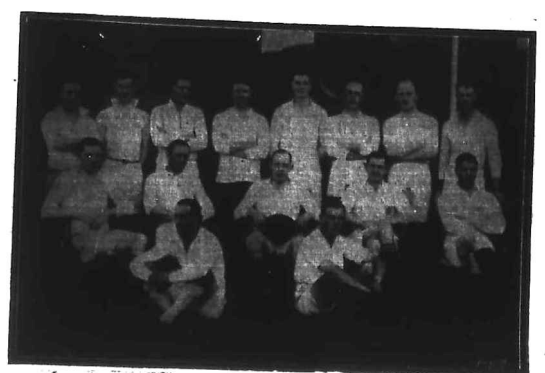
THE VICTORIOUS NAIROBI TEAM.