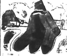
Superior Quality in Champagne Colour and Light Grey in a soft make. Size 9 1/2 to 11 1/2.