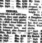
"SHAVING GUTTER" In Black Metal. Sh. 1/6 each.