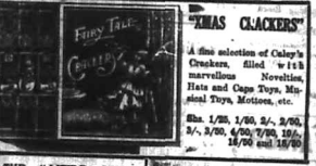
"CHRISTMAS CRACKERS" A fine selection of Cracker Crackers. Sh. 1/6 each.