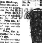
"TRAVELING SHAVING CASE" In Black Metal. Sh. 1/6 each.