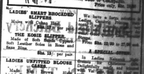
"THE KOBIE SLIPPER" In various designs. Sh. 1/6 each.