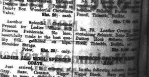
"LADIES CORD LEATHER BLOUSE CASES" In various designs. Sh. 1/6 each.