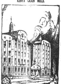
KENYA GRAIN MILLS

THE MILITARY CONTRIBUTIONS... THE LABOUR CONDITIONS ENQUIRY