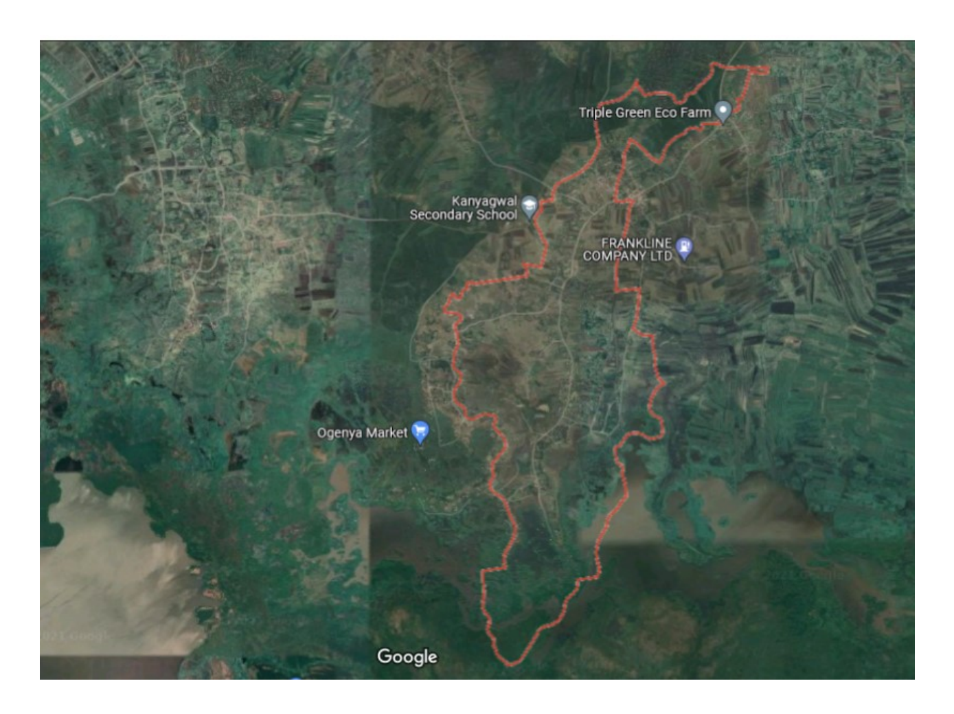
Figure 2: Satellite Map of Kakola-Ombaka.

through the floods and drought due to culture and traditions. Nyando Wetland which is the focus of the study covers a considerable portion of Kakola Ombaka. The figure below shows the location on Nyando Wetland.<sup>5</sup>