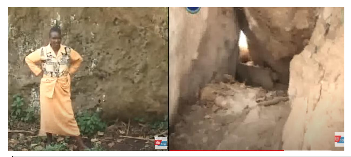
Fig. 1. Salome Matakwei at Kabionge cave- where there Wycliffe Matakwei and the SLDF group hide: KTN Documentary picture: "secrets of the mountain" Documentary , dated 04 November 2009