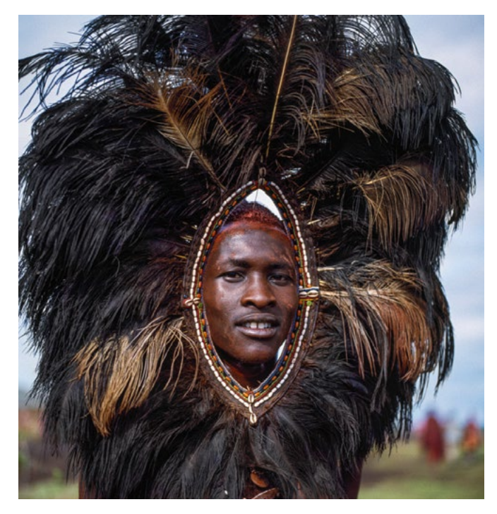
Fig. 7. A Maasai man wearing a headdress made of ostrich feathers.