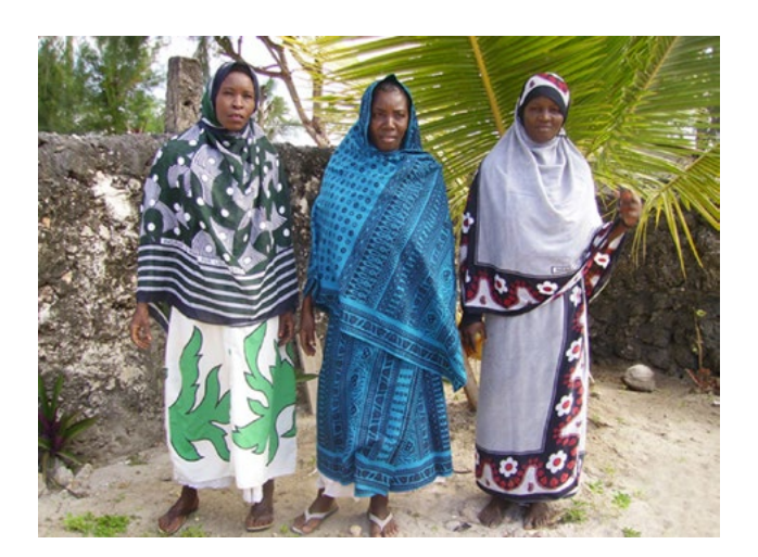
Fig. 5. Women wearing kanga

The messages, or Jina, weren't initially a part of kangas. They were only added at the beginning of the 20th century. The messages use proverbs, poetry, or a moral from a story in the Swahili language to convey many types of messages. could be advice for people to learn good habits and good family values or a positive message to themselves, which is most applicable to girls' reaching womanhood or young women; in that case, the messages serve as teachings and warnings about possible situations in life. Some messages act as secret romantic messages intended for their husbands. Or, they could be a subtle insult intended for a specific person or, viewers in general. Women oftentimes aren't able to verbally express themselves due to societal norms, but they feel like they can truly speak their minds through the messages on their kangas.