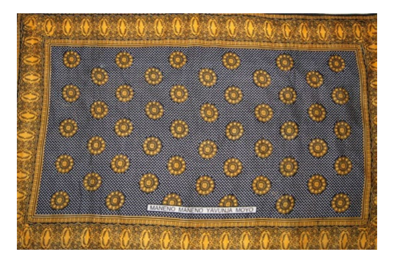
Fig. 4. A khanga fabric with a Swahili message

The word kanga translates to guinea fowl in Swahili and it is named that way because the patterns on the fabric resemble the specks on the feathers of the local bird. The designs often represent the Tanzanian landscape, flora, fauna, and cultural symbols. Designs can even have political logos and