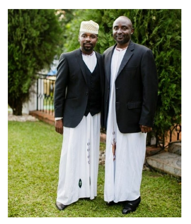
Fig. 3. Kanzu with a suit jacket.

Tanzania is also home to over 120 tribes who have their own cultural identity and thus their way