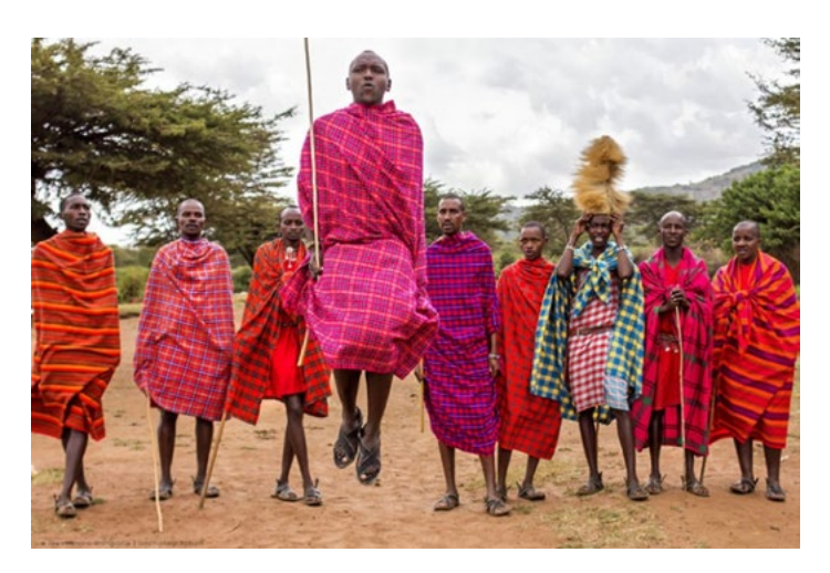
Fig. 6. Maasai in shuka.

Ethnic groups like the Maasai have been able to preserve their way of dressing but, most people in Kenya have adopted western-styled clothes as their everyday attire in this era.