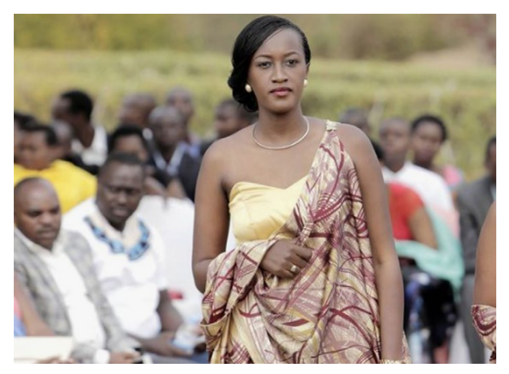
Fig. 8. Rwandan mushanana

Mushanana or Umushanana is a sash draped over one shoulder, worn over a tank top or bustier with a wrapped skirt bunched at the hips. Mushanana is made from silk, a gauzy and lightweight fabric to create a flowing effect, and polished cotton. Mushanana was formerly worn by older women daily but has now become a staple attire for formal occasions such as weddings, funerals, and church services. The dress is also the standard costume for female dancers in the country's national dance troupes.