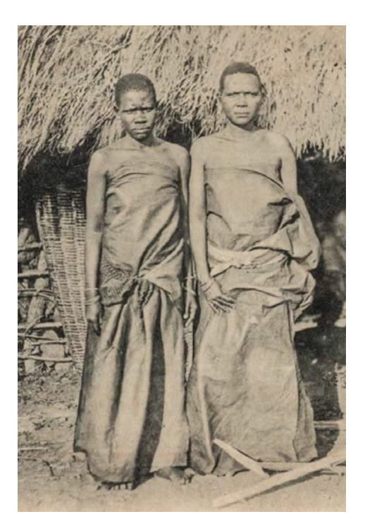
Fig. I. Ugandan Women in a bark cloth wrapper.

Barkcloth was another material that was used to make clothes. When humans learned how to make tools out of stone, they invented tools to peel, pound, and soften tree bark, enough to make fabric.