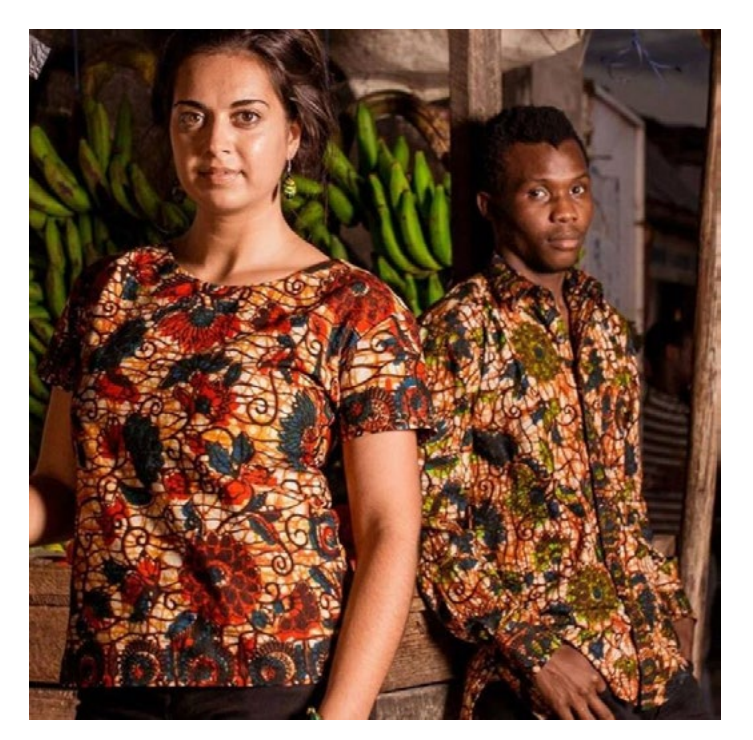
Fig. 2. Ugandan Women in a bark cloth wrapper.

Kitenge is a cotton fabric that uses a variety of vibrant colors and patterns made using a version of the Indonesian batik technique with a reason behind it.