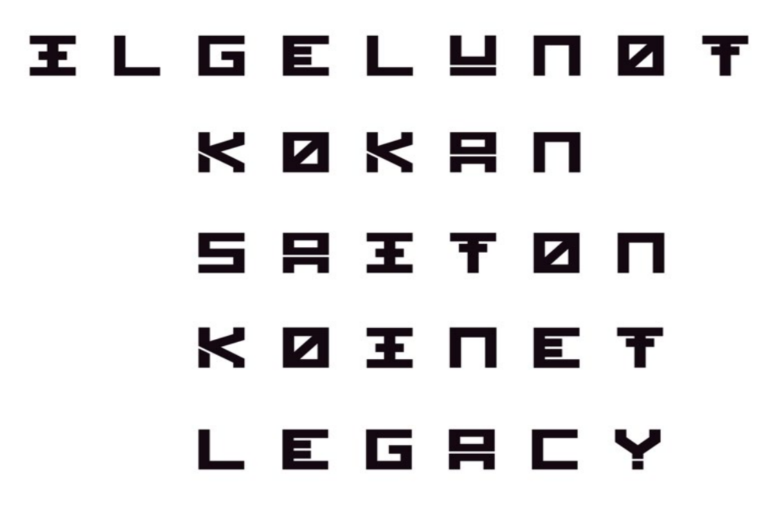
Fig. 4. Illegelunot typography.

vi) The typography (Fig. 4) illustrated on Illegelunot is specifically designed for the series and reflects tribal patterns infused in a contemporary san serif font.