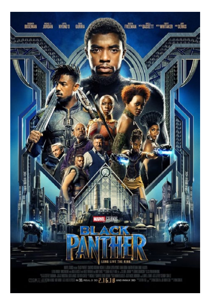
Fig 2. Marvel's Black Panther film poster.

Further attempts to differentiate Afrofuturism and Africanfuturism are made when Wabuke emphasized the importance of appreciating Africanfuturism in the context of a 'greater specificity of language, ridding itself of the othering of the white gaze and the de facto colonial Western mindset'. Moreover, Okorafor rejected the term Afrofututurism and refers to her work as Africanfuturism and made the distinction clear: Afrofuturism: Wakanda builds its first outpost in Oakland, CA, USA. Africanfuturism: Wakanda builds its first outpost in a neighboring African country (Wabuke, 2020).