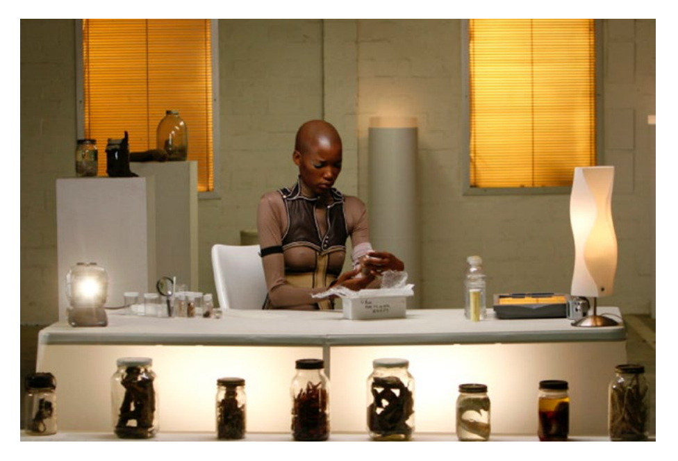
Fig II. Pumzi: Photo courtesy of Wired.com/Inspired Minority Pictures and One Pictures

ii) Hi-tech costuming such as arm scanners, dazzling white lights, glass screens depicted in the film, and snake venom and other specimen/paraphernalia have strong links to science fiction and African traditions, respectively.