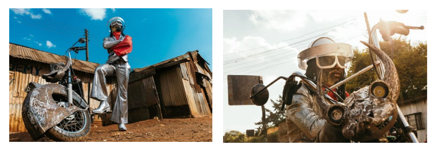
Fig 6 and 7. Kibera Ghost Rider. Kevo Abbra.

Abbra is reimagining the narrative around African fashion and art through Afrofuturism. His latest project Kibera Ghost Rider , (Fig 6 and 7) is changing the game (Ngema, 2021).