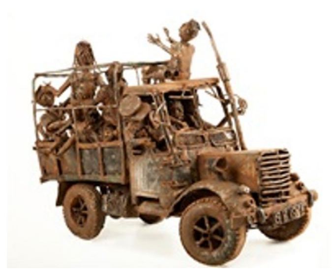
Figure 7. The Hawkers, 2015

But, ultimately, Mbatia's amazingly intricate scrap metal sculptures may be the art that he will be best remembered for. Like his realist paintings, his sculptures also capture iconic images straight out of Kenyan everyday life. And as with his paintings, he injects heavy doses of humour into his works. The extraordinary fact about his scrap-metal characters is that he only learned how to weld a few years back. "The man who came to weld the windows of our (new stone) house inspired me to learn to do it myself," he said. The hawkers (Figure 7) is a sculpture that highlights the plight of hawkers, who are arrested by city inspectorate officers and are carried away in the county officers van.