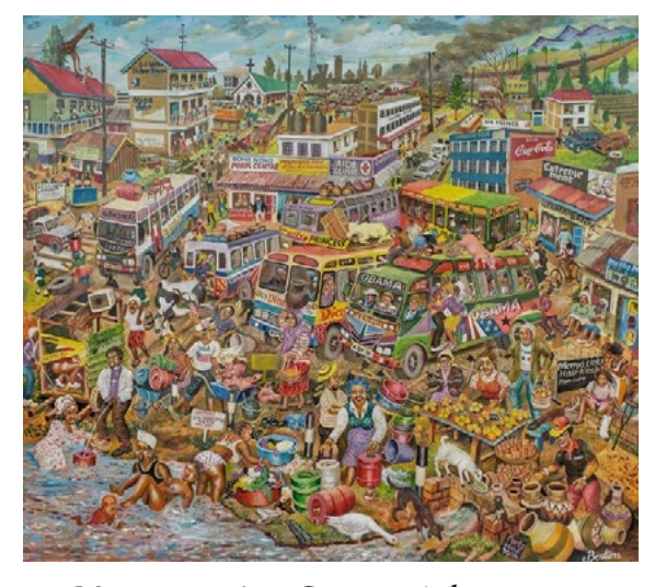
Figure 5. Matatu station.

Another favorite theme on Bertiers canvases is the Kenyan transport system and market scenes. He highlights the many challenges in the transport industry including traffic jams, overcrowding and overloading of buses with passengers and animals on the carriers. The painting below named Matatu station (figure 5) also shows poor sanitary conditions and water pollution from a roadside market with people swimming in the river while another woman washing clothes nearby and a woman fetching water from the river as a pastor urinates into the river. All these is displayed in his characteristic satirical manner. The world's craziest bar (figure 6) depicts world politicians in a party.