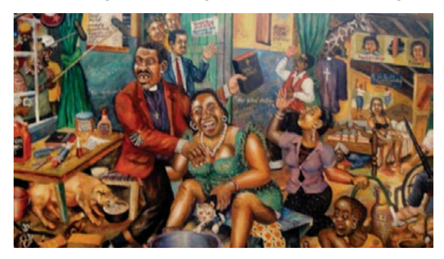
Figure 4. Faith Here

woman in the background waiting on the preacher's bed in a state of near undress suggests something about what the attempted "30 minute miracle cure" will involve. The longer drawn out treatment for diabetes – and no doubt less indulgent – is the highest at half a million shillings.