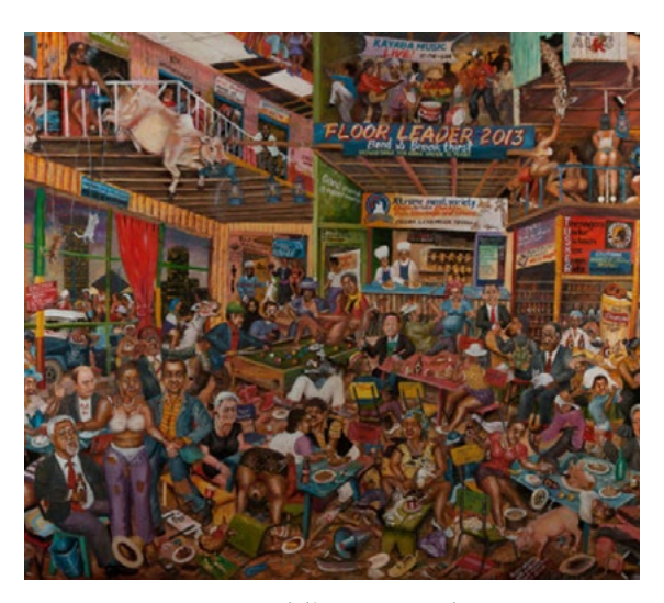
Figure 6. World's craziest bar , 2006.