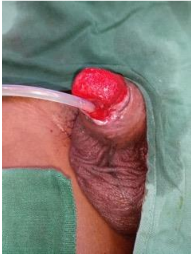
Figure 5. Penile Gland after losing the glans and skin with good granulation tissue

Post-operatively, we transfused 3 units of blood and gave paracetamol, morphine, and tramadol for analgesia. We used enoxaparin (Clexane; Aventis Pharma Ltd., Midrand, Gauteng, South Africa) and aspirin for anticoagulation. Monitoring was done every 2 hours, and post-operative congestion was noted at 20 hours. The patient was taken back to theater for exploration.