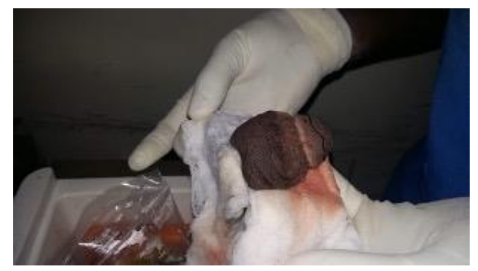
Figure 2. The amputated part.

The stump and amputated part were both prepared by cleaning them with saline using a syringe and gauze,