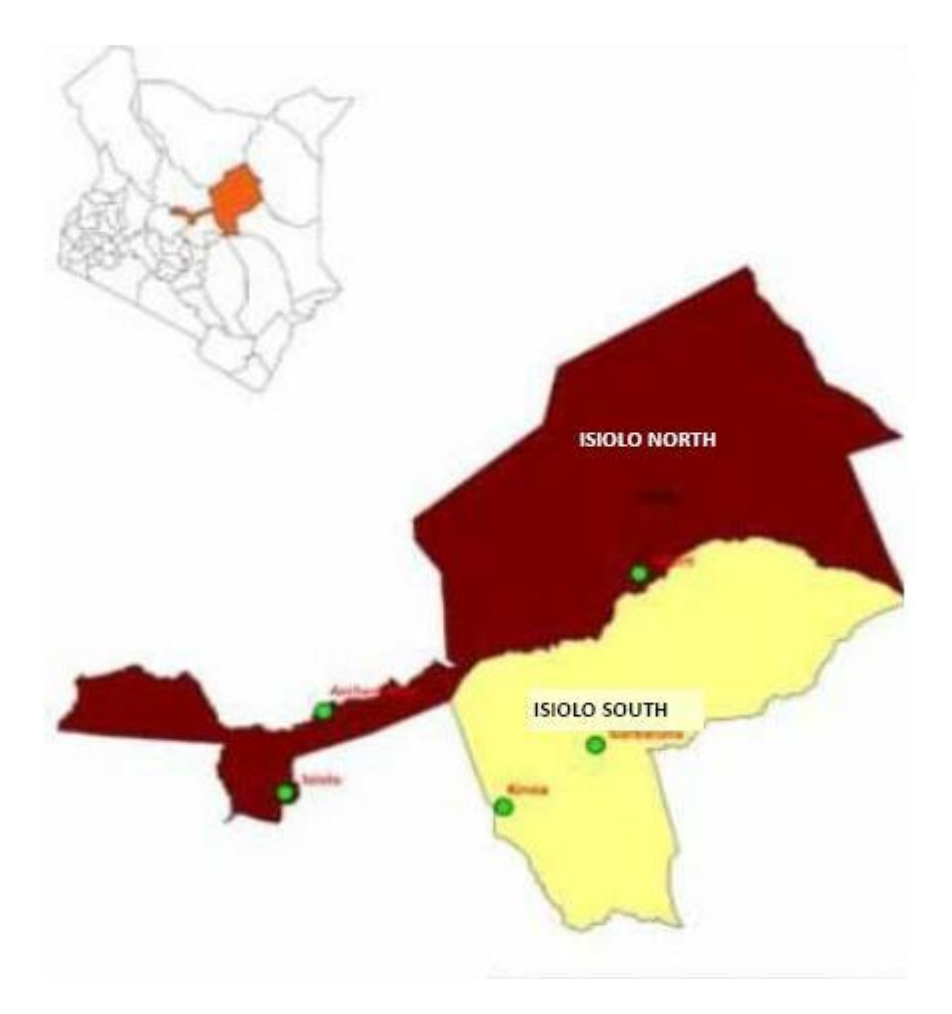
Figure 3.1: Map of Isiolo County showing the study sub-counties.