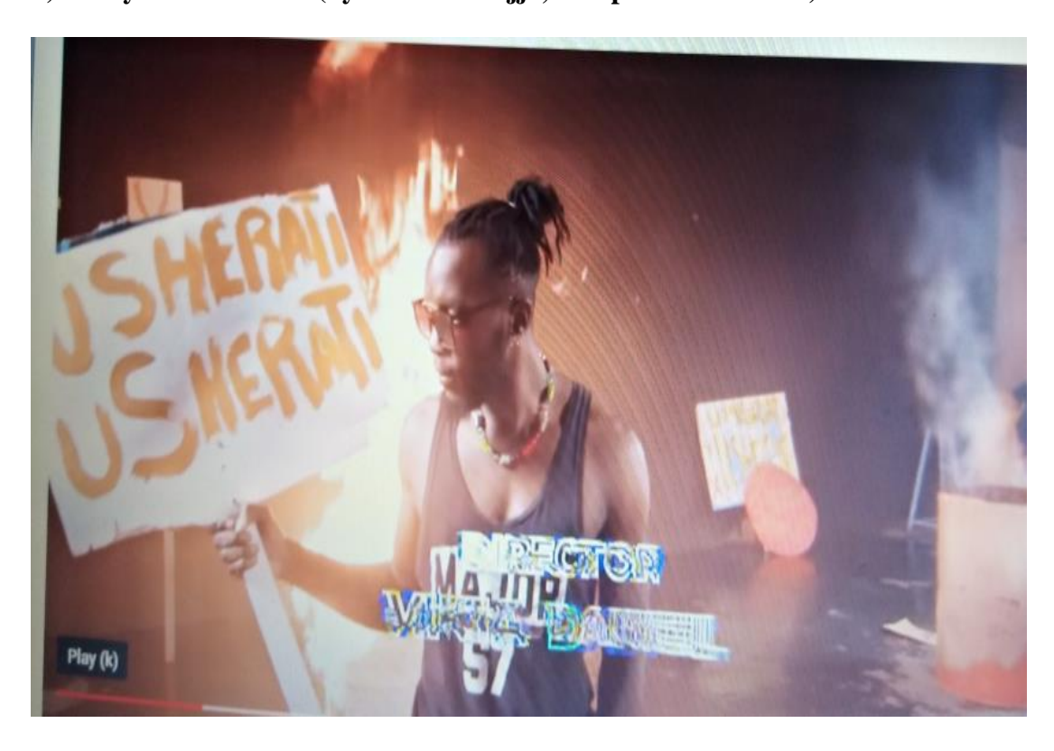
Figure 4.2: image of an artist holding banner written 'USHERATI'