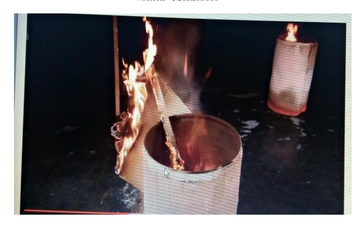
Figure 4.4: image of a burning 'USHERATI 'banner

From the above images (figure 4.2, 4.3, 4.4) the artists and supporters are seen in the video holding and burning banners written usherati to symbolize how they wish it could end completely. The youth are demonstrating against negative values. In the lyrics, the