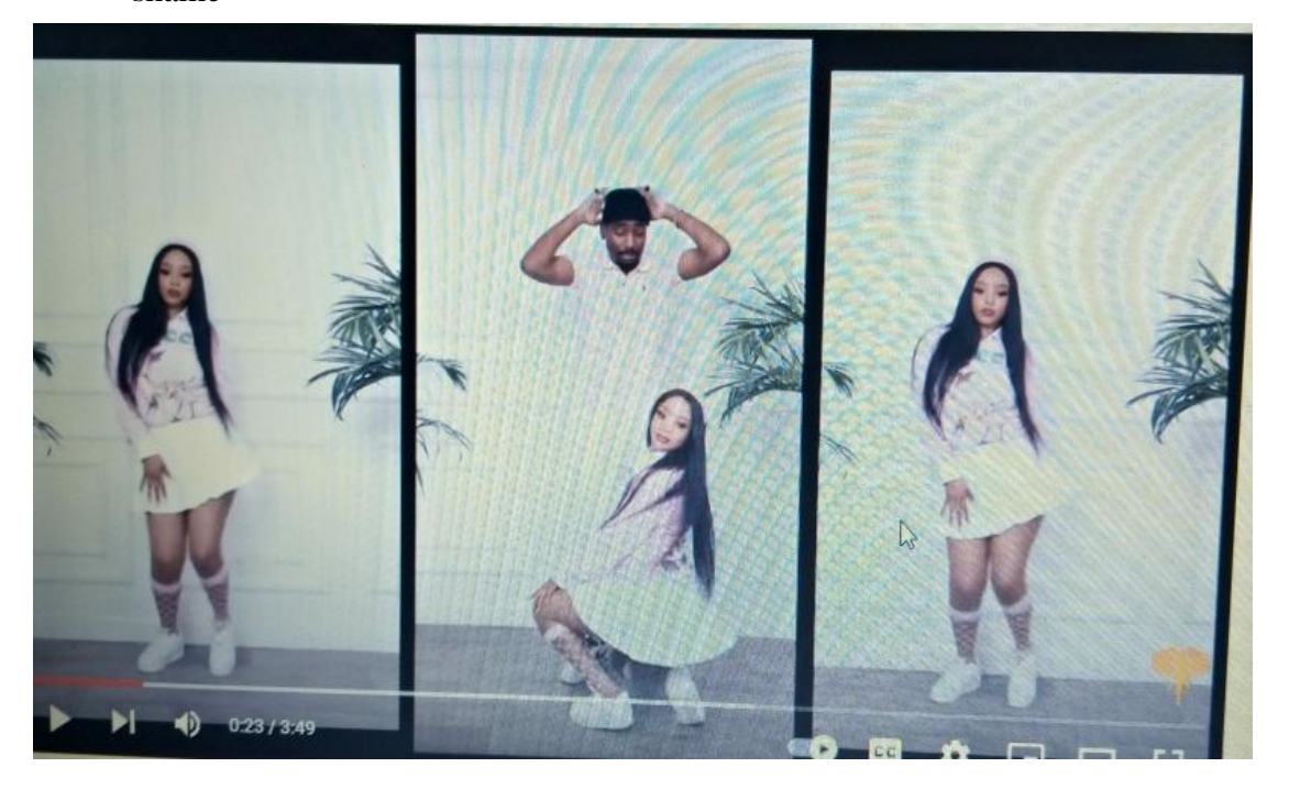
Figure 4.1: An image from Ndovu ni Kuu song showing the description of campus ladies

Ako na kila kitu kitu hanaga ni aya – she has everything she needs except shame