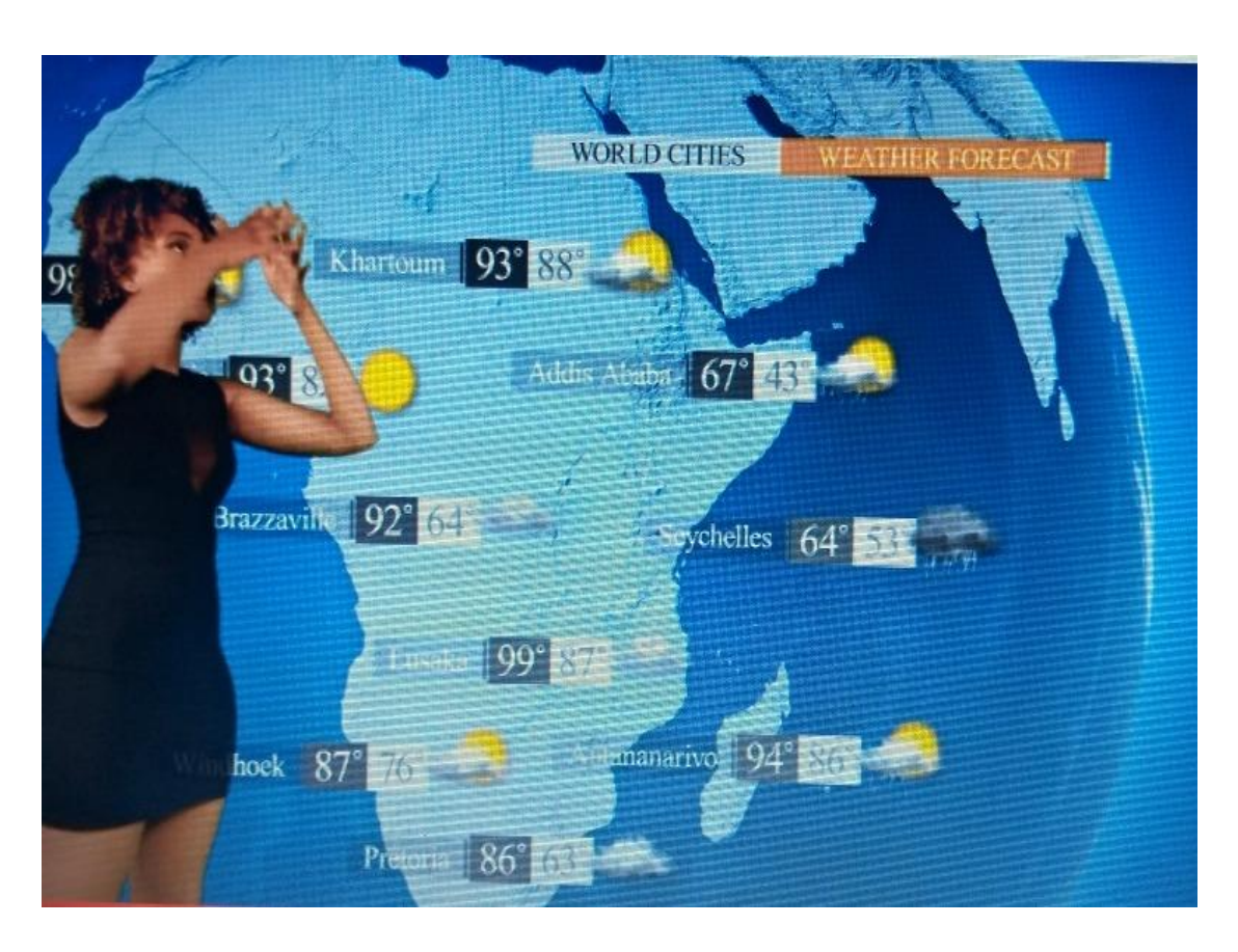
Figure 4.5: image of a video vixen reporting weather forecast of how usherati has spread all over the world.

Ushe usherati! Naogopanga sana usherati – prostitution! I really fear prostitution