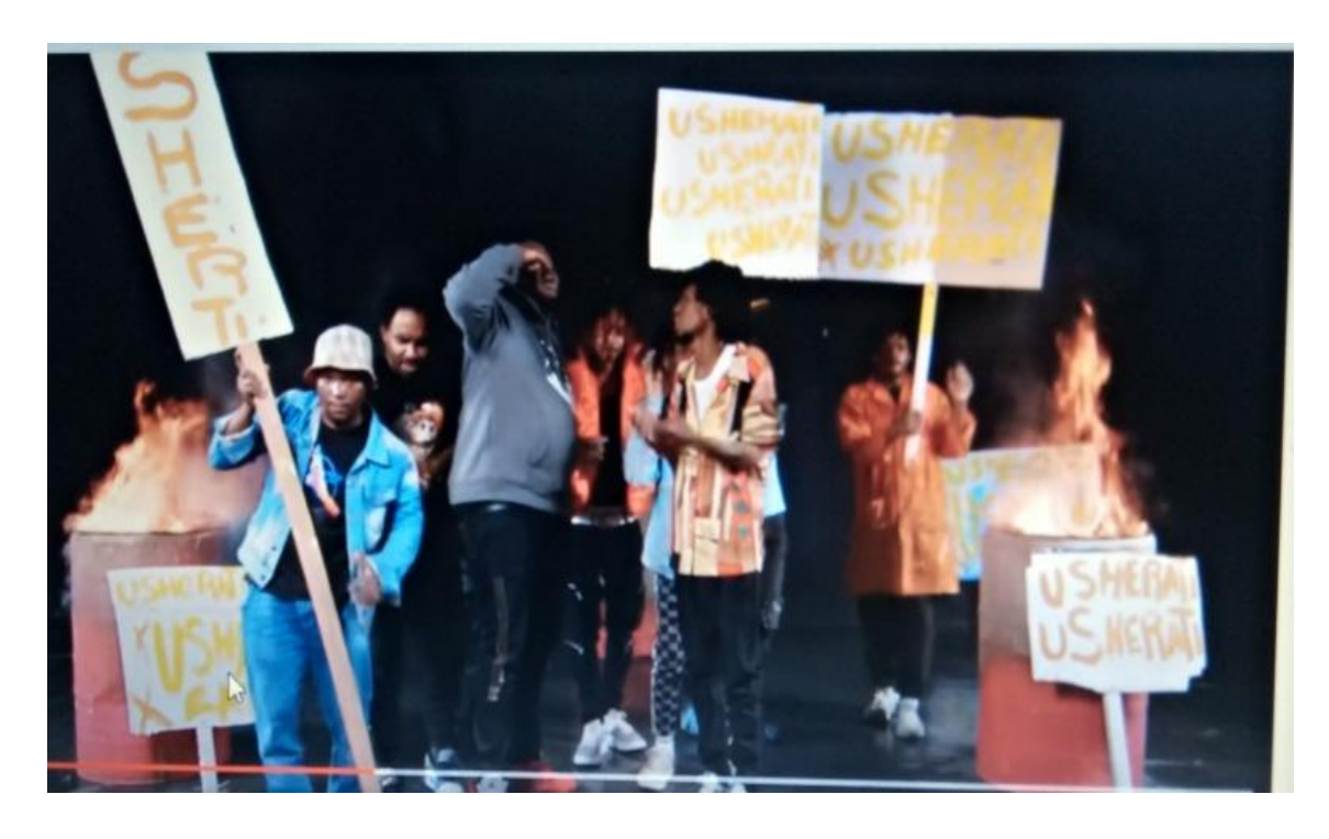
Figure 4.3 image of youths and usherati artists holding and burning banners written ' USHERATI '