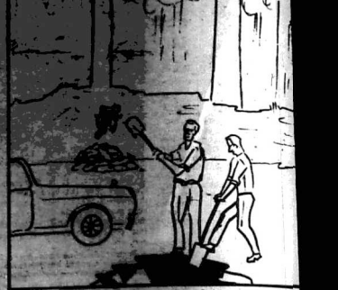
Print this picture and complete the form below, you may win a "East African Standard", P.O. Box 3060, Nairobi.