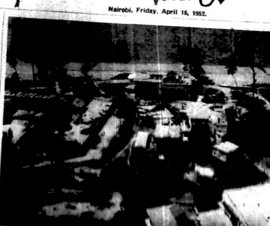
Two views of the wreckage of Lindi, hit by a tropical cyclone on Tuesday.

Storm-struck Lindi cracks the wreckage. A tropical cyclone struck Lindi on Tuesday morning, causing widespread damage to the town and surrounding areas.