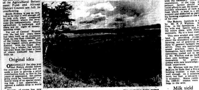
Filter strips help to hold up soil wash and prevent erosion. This method is being pushed everywhere in Nyanza.

1. LUGALD comprises Central Nyanza and a big chunk of the Kisi District, but it is not Central Nyanza. Lugalda may be called the Central District of Central Nyanza. It is a humming, thriving Province of the rich and the coffered. It is the seat of the Agricultural Settlements of the African District Council are full to overflowing. 2. So much to do, so little time... GRANVILLE ROBERTS, in the second of his new series of articles on the African lands of Nyanza Province, discusses the possibility of using cotton funds for rehabilitation in Central Nyanza.