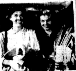
Miss Chris Hart and Miss Shirley Fry, American lawn tennis stars, on their arrival in Nairobi on Tuesday. They will appear in a series of exhibition matches on the Centre Court of the Nairobi Golf tomorrow and the day after.