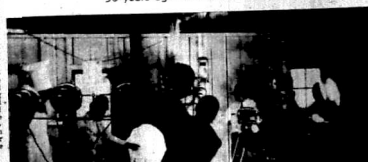
Members of the staff of the African Information Service making a film of "Leta Ohukuu."

THERE is a lot of misunderstanding of the meaning of Community Development and this is an attempt to explain it. Put simply, it means Adult Education leading to progress through the principle of self-help. Education is not merely learning to write and do arithmetic, however, but includes the acquisition of general knowledge about the country and its Government, how it is being developed and the reasons for that. The various Government Departments, what the various services are, and the characteristics of the various departments, while adapting oneself to prevailing conditions, while adapting oneself to changing social conditions, the importance of good roads and railways, and the other services provided by the Government, and finally the appreciation of the need for voluntary activities and of people helping themselves.