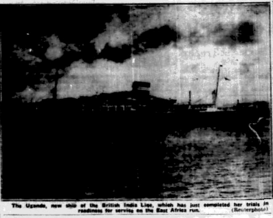
The Uganda, new batch of the British Indian Army, which has just completed her trials in readiness for service on the East Africa run.

It was also reported that some wholesalers were still in the market, but that a Council of Wholesalers had been formed to coordinate their efforts. The Council was expected to meet on Friday to discuss their proposals.