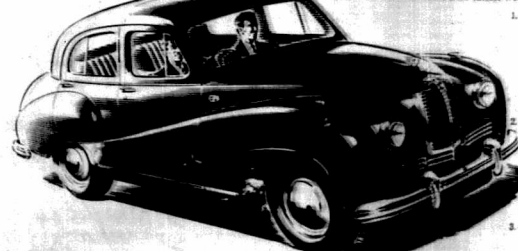
Check tyre pressures every week, or every 200 miles.