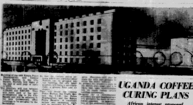
Building of the new Kenya Parliament and Central Government offices in Nairobi.