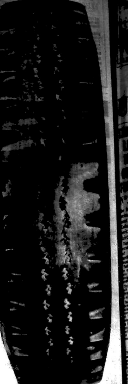
An AVON tyre after 2007 grim miles