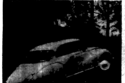
Surviving the whole frame shell is E. introduced instead.