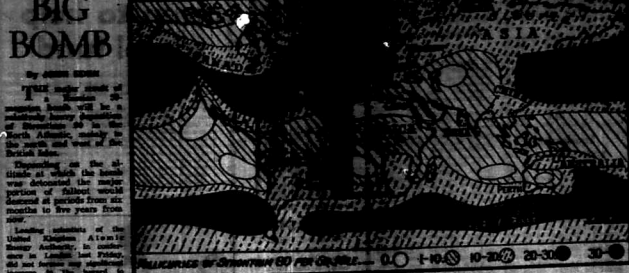
THE estimated world distribution of Strategic D Bombs as based on one issued by the United States Weather Bureau.

On the whole, the world is not in a state of panic. The British Government has been so successful in its negotiations with the French Government.