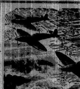
The International Airplane... The British Empire... The British Empire...