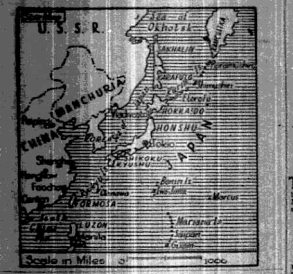
Scale in Miles