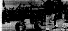
Queen Wilhelmina of the Netherlands (standing in car in center of the picture) accepts a submarine chaser transferred from the United States to the Royal Netherlands Navy. It was named the Queen Wilhelmina and put into commission by the Queen herself.

WARSHIP AS GIFT 'SAIL AT ONCE FOR GIBRALTAR AND JOIN US'