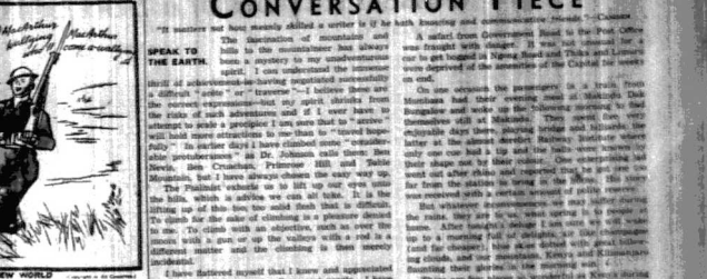
Illustration of a man in a hat and coat, possibly a soldier or a worker, standing in a field. The illustration is signed 'W. H. H. H.' and 'The East African Standard'.

The loss of Singapore, the only British possession in the East Indies, was a heavy blow to the British Empire. The loss of Singapore, the only British possession in the East Indies, was a heavy blow to the British Empire. The loss of Singapore, the only British possession in the East Indies, was a heavy blow to the British Empire.