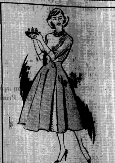
DOUBLE FASHION by Evelyn Wood

BLOW not - blow cold - this Jaques Fath Boutique model takes care of the problem most successfully, for here you have an additional skirt that can be worn or staid according to the temperature day by day. In this case, worn over a wool lace dress, it is made in a bright turquoise heaviest quality fabric, and is held by only one button revealing the dress beneath. For everyday practicality, you could wear such a skirt over a straight wool jersey or any other lightweight warm dress. Three colour suggestions are: a muted belated skirt over oatmeal, or bright green over a black dress, or of course the indispensable black which will do duty for any colour dress.