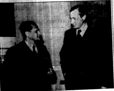
The British Minister of Defense, Mr. Sandys (left), meets the French ambassador, Mr. de Gaulle (right), at the Foreign Office. Mr. Sandys is seen to the right of the French ambassador, Mr. de Gaulle, in the photograph above. Mr. Sandys and his wife were in good luck and French ambassador, Mr. de Gaulle, was in the center of the photograph above. Mr. Sandys and his wife were in good luck and French ambassador, Mr. de Gaulle, was in the center of the photograph above.

Perhaps it was a mistake of the hour that brought the Queen Mother to the scene of the riot at the Victoria Palace in London on Monday night. The Queen Mother, who had been invited to the Palace to see the film of the riot, had the good fortune to see the riot in progress.