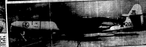
The Sea Hawk, the Royal Navy's nuclear fighter plane, is the first British jet fighter to have German markings. The West German Government has announced that it will accept the German Government's offer to purchase the aircraft. The aircraft is worth more than £25,000,000.