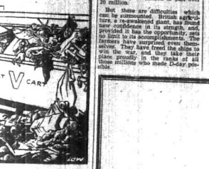
all-arms farm before the war. He was told that he must make the most of his land and produce as much as possible. It was a great change for him, but he did it.

Dairy Farmers It has not been long since a farmer who was a dairy farmer before the war, had to take over a farm which was a dairy farm before the war.