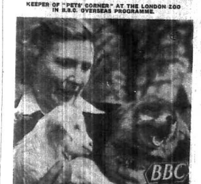
KEEPER OF "PETTY CORNER" AT THE LONDON 200 IN R.S.C. OVERSEAS PROGRAMME

Always keep a tin handy you may need it urgently. THERMOGENE MEDICATED RUB