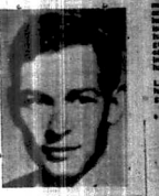
De Gaulle On Fairness, Courage And Resolution