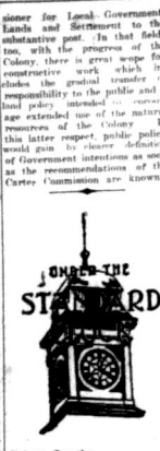
UNDER THE STARD