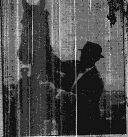
COL. HARRY LLEWELLYN WITH FOXHUNTER

INNER SPRING MATTRESS ON WHEELS ... that on Col. Llewellyn's return to the United States, he will be able to give a special effort to the Welsh Gorsedd. He will be able to give a special effort to the Welsh Gorsedd. He will be able to give a special effort to the Welsh Gorsedd.