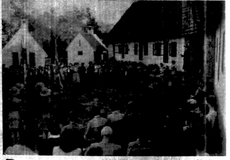
The picture above was taken on the occasion of the opening of the new Girl Guide Headquarters in Nairobi, when M. K. the Governor, Sir Philip Mitchell, unveiled a plaque.