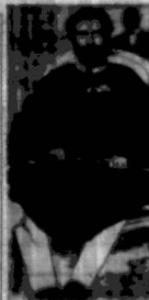
The Emperor of Abyssinia.

London, May 11. The Imperial Trans-Pacific Air Survey has been approved by the Government.