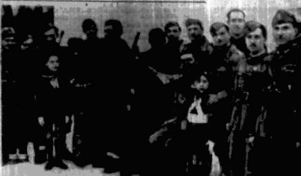
The Spanish Government's proposal for action in regard to the Italian and German "invasion" of Italy, is to come before the League Council. The picture shows Italian troops, wounded in Spain, on their return to Italy.

British Press in London. The British Press Minister told Parliament that the British Government were attempting to negotiate an armistice with the insurgents.