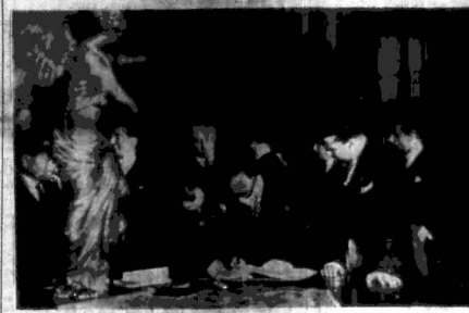
The scene in the Vatican Room in the Chigi Palace in Rome when, under the aegis of the Vatican, Lord Perth and Count Ciano signed the Anglo-Italian treaty. The Egyptian minister, who also signed it, was behind the representatives of Britain and Italy.