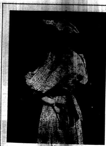
Bliss of ink flying from a fountain pen... the spectacle and the dress of rather than the other way about.