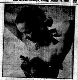
IT GIVES A GREAT SELF-CONFIDENCE... to know that's always fresh. And so thoroughly perfumed, you know it's both with Cary Talbot.