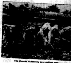
The Homemakers is showing an excellent example for them because of the

In a recent leading article in this paper it was suggested that a number of women's organisations, such as the Homemakers and the Mothers' League, should co-operate with the women's league, the formation of which was inaugurated at the last Council meeting of the East African Women's League.