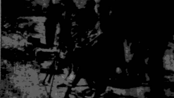
Koreans and British protesters were fighting side-by-side during the riots in Los Angeles. The rioting was reported to be spreading to other parts of the country.

After 8 1/2 days of the riot, the city area, the Greater Watts area, was still under a curfew. The rioting continued but was contained under control. Although the rioting was contained under control, it was reported that the rioting was still going on in some areas.