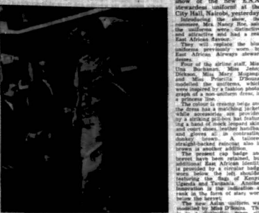
Miss Patricia O'Shea, modelled the uniforms, which were inspired by a fashion designer of a new-entrance dress in a gesture of respect to the staff. The uniforms were designed by a fashion designer of a new-entrance dress in a gesture of respect to the staff.

The sound of a jet plane coming in to land and a voice over the loudspeaker announcing the arrival of a new line on East African Airways routes inaugurated a fashion show at the new E.A.A. headquarters yesterday.