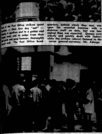
Members of the Post Office strikers spent their first day "out" in a public square and to a public square. The Post Office head-...

To all B.T.C. students: The British Tutorial College is pleased to announce that it has been granted a licence to operate in the United Kingdom. The B.T.C. is now open for business in London, Glasgow, and Edinburgh. The B.T.C. is a private institution and is not a charity. It is a limited liability company. The B.T.C. is a registered company in the United Kingdom. The B.T.C. is a registered company in the United Kingdom. The B.T.C. is a registered company in the United Kingdom.