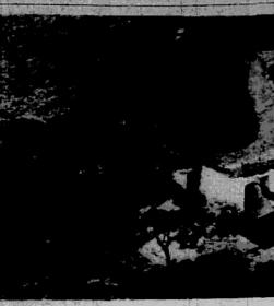
Moving from the open door of a Dakota aircraft of the Royal Air Force, King Farouk of Egypt and King Ibrahim of Egypt are seen in the event of the Cairo head-quarters of the National Front. King Farouk is on the left and King Ibrahim is on the right.

PUNY ELECTION —Results in the Punjab (Parliamentary) election were announced by the National Front, according to a report received in London. MANHUNT IN FLORIDA —A manhunt for a suspected kidnaper is being conducted in the State of Florida. RECEIVED IN VIETNAM ARMY —The Viet Nam Army has received a large shipment of military supplies.