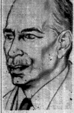
Lord Keynes, a famous economist, has passed away.

London, April 23. (Reuters) - The Anglo-American Commission has announced plans to take over the administration of Palestine.