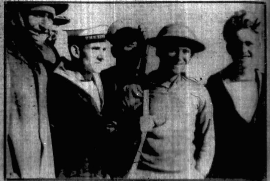
The Army and Navy co-operate.