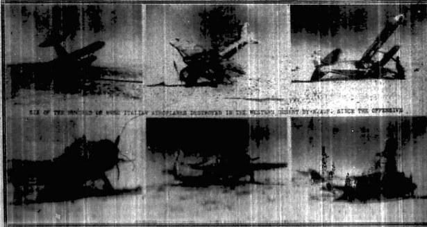
Wreckage in the desert.