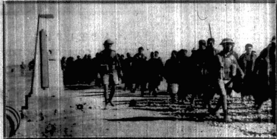
Italian prisoners passing a Fascist monument erected by the Italians when they captured Sidi Barrani.