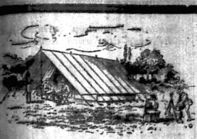
OUR CAMP EQUIPMENT MEANS LAST WORD IN COMFORT.

Ahamed Bros. Hardings Street, NAIROBI. Phone No. 2201.