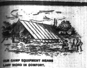
OUR CAMP EQUIPMENT MEANS LAST WORD IN COMFORT.

Ahamed Bros. Handling Street, NAIROBI. Phone No. 2201, Box No. 254.