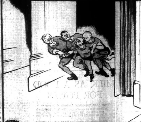
Loggins (At All Countries)

Two events have occurred this week to help people's eyes and ears towards the possibility of South African troops being sent