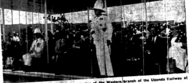
Sir Andrew Cohen, speaking at the opening of the Western branch of the Uganda Railway at Kampala.

By LEBLEY CLAY It was a very striking and colourful crowd that assembled on the platform at Kampala Station when the special train containing Kanoo and the opening of the Railway extension and the Kileleshwa Mini Theatre.