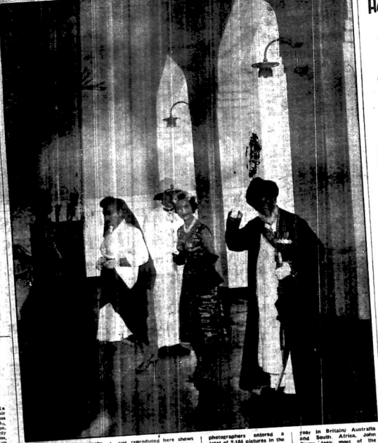
The Royal Mail photograph during the Prime Minister's visit to the East African States in October, 1956.

Consult the sole distributors: FIRROD TRADING COMPANY (E.A.) LIMITED P.O. Box 1181, Nairobi