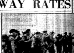
Thanks to U.N. troops

W.D. & H.O. WILLS eoman CIGARETTES NET VALLEY CIGARETTE CO. LTD.