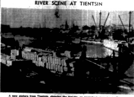
A new picture from Tientsin, showing the Hai-Ho, an important river for traffic.

The League High Commissioner, who is reported to have been in London for several days, is reported to have been in London for several days.