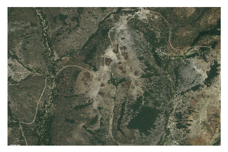
Fig.2 Satellite image of settlements in the Loita area showing the unpaved dry-season access roads, the settlement surrounded by an open area where the vegetation has been overgrazed (light brown) and several cultivated land parcels (dark brown, straight sides), all embedded in a matrix of dry bush land with scattered shrubs. Areas with denser vegetation can be seen along the stream valleys.