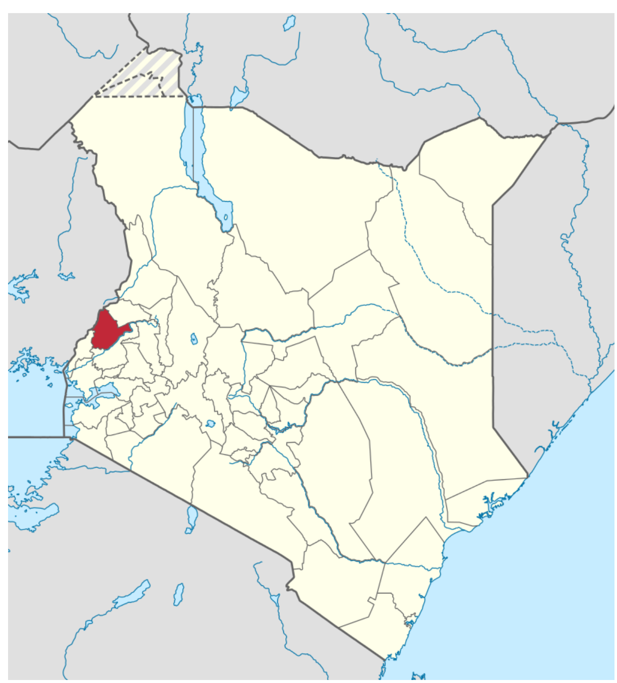
Figure 1 Map of Kenya showing the location of Bungoma