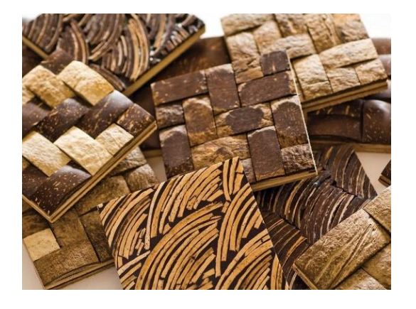
Figure 2.1: Coconut tiles, Source: ResearchGate, 2021

From an interior perspective, coconut shell can be fashioned into tiling solutions by crafting small cuts of coconut shells that are joined to create larger tiles. These tiles improve indoor air quality due to improved circulation within the tiles.