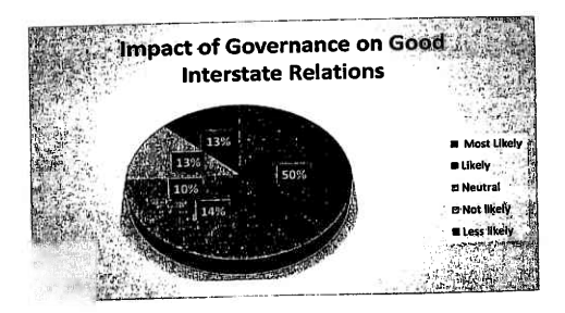
Fig 4.2 Impact on Inter State Relations

Kenya has had an increasingly tough stand toward the state behavior of Eritrea based on the international norms and values of governance. The war on terrorisms and allegation that Eritrea