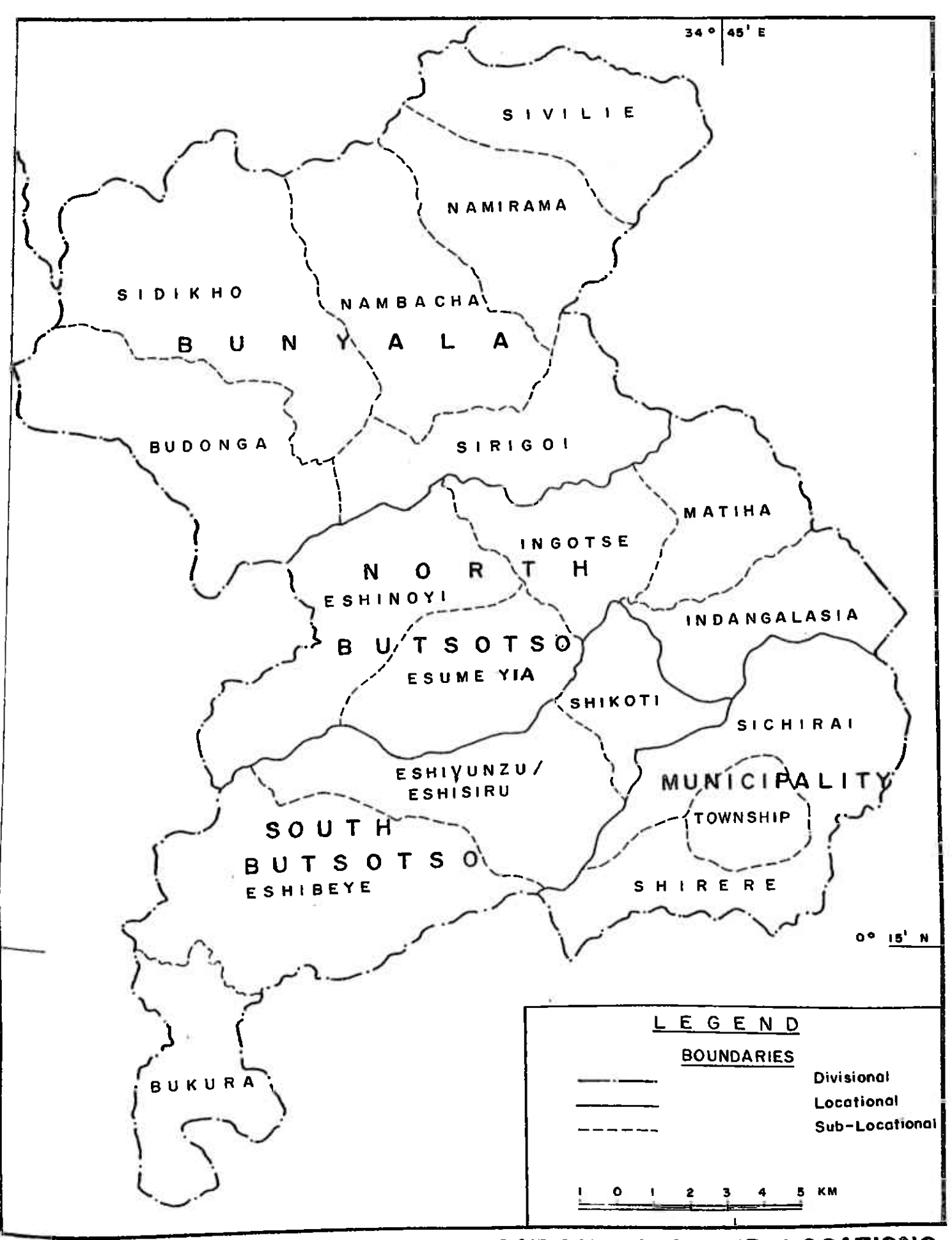
MAP 2: LURAMBI DIVISION : LOCATIONS AND SUB-LOCATIONS