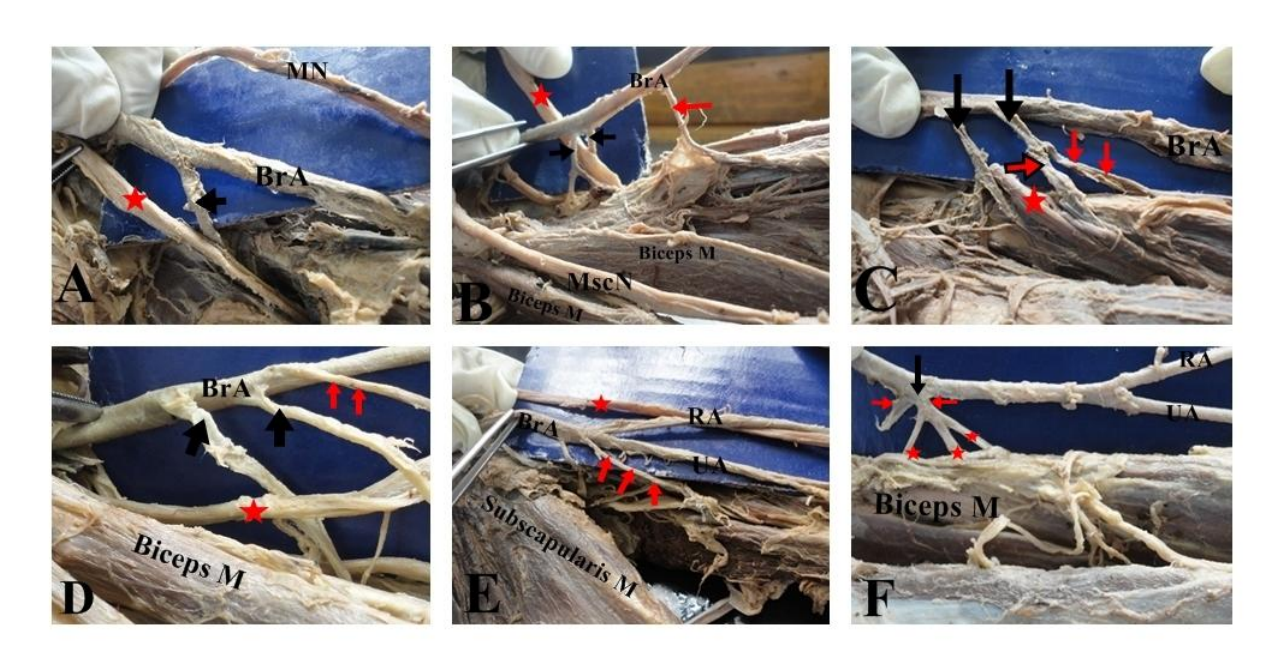
Fig 1: A-F: Pattern of origin of PBA. A: Single PBA, (arrow), from brachial artery (BrA), entering the radial groove with the radial nerve (red star). MN is the median nerve. B: duplicated PBA (black arrows) with radial nerve in between them (star) Note that the Radial nerve (RN) passes in between the two trunks. Additionally, these two arteries seem to have arisen from the same point on the artery. The red arrow points on the superior ulnar collateral artery. MscN is the musculocutaneous nerve. C: "double" profunda brachii (arrows) where the second artery (radial collateral) arose in common with the superior ulnar collateral. D: double PBAs with high ulnar collateral (red arrow). E: Trifurcation of the brachial artery (BrA), into PBA (arrow), ulnar (UA) and radial (RA) arteries. F very short trunk of PBA (arrow) originating from the brachial artery and immediately bifurcates, one of the arteries further divides into three branches. Note that the brachial artery also divides higher up in the arm into the radial and ulnar arteries.

brachial artery into PBA, ulnar and radial arteries (Fig. 1E). Two of the PBAs arose as a very short trunk that immediately bifurcated into two branches, one of which then trifurcated (Fig. 1F).In 6 cases (4.8%) the PBA trifurcated immediately after its origin into three terminal branches (Fig. 2A). Eighteen (12.5%) profunda brachii divided immediately (within 2cm of its origin) into its two terminal branches, with the radial nerve in between the two trunks (Fig. 2B), or the radial nerve running in parallel with one nerve (Fig. 2C). Table 1 summarizes the above findings. It was noted that more variations were observed on the left than on the right and this proved to be statistically significant with a p value of 0.001 (see Table 2).