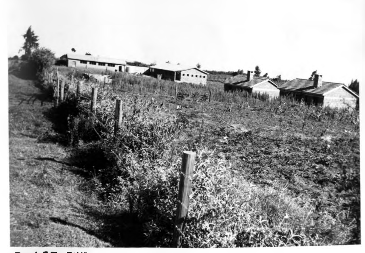
PLATE TWO THE FIRST PHASE OF GITHA SELF HELP HOSPITAL