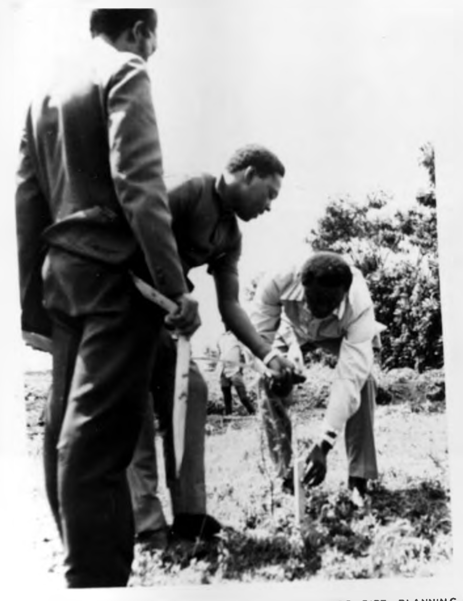
PLATE THREE SURVEYING THE GROUND FOR SITE PLANNING BY THE PUBLIC