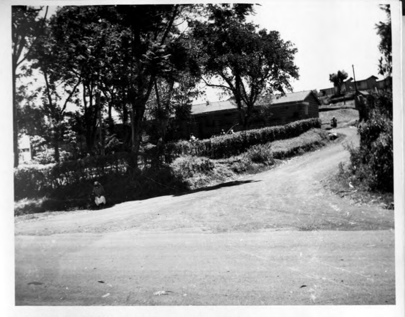
PLATE ONE GITHUNGURI HEALTH CENTRE