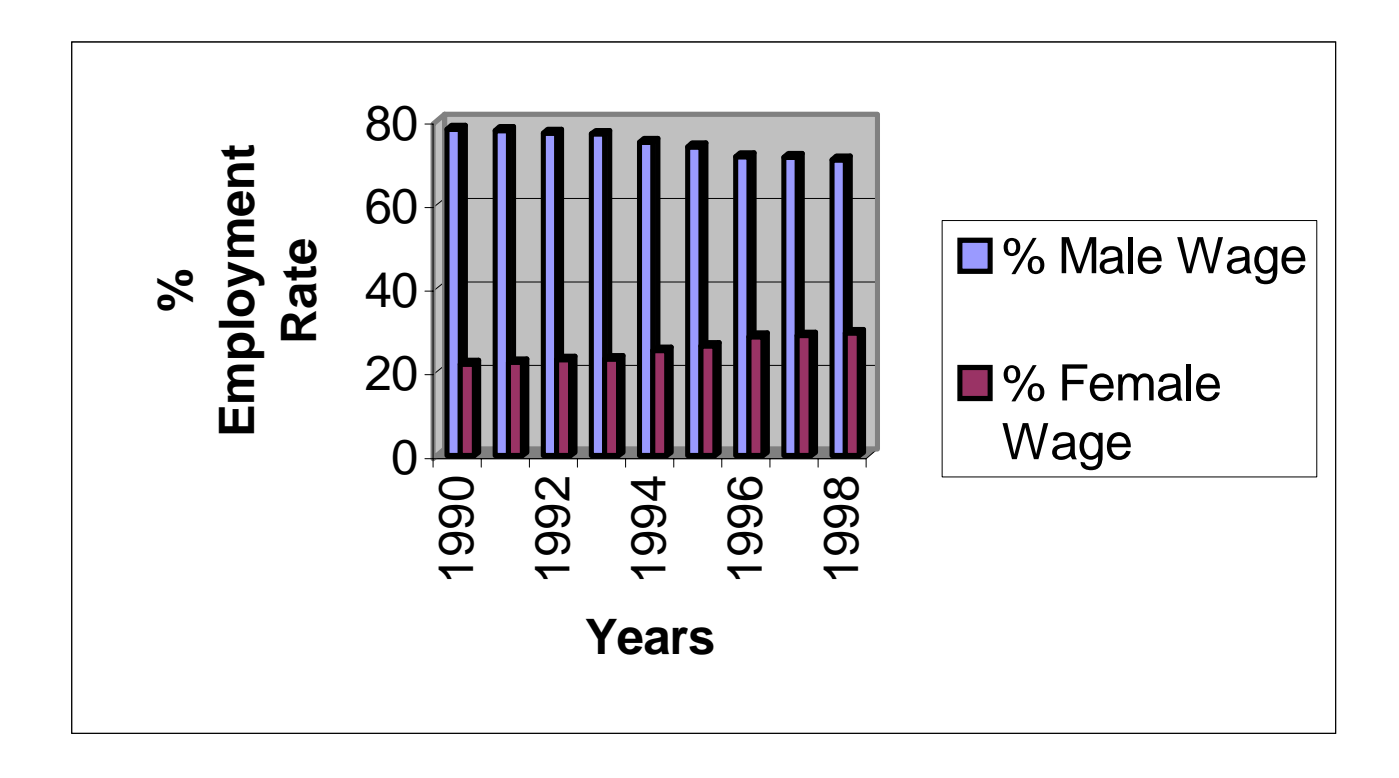
Figure 3. Wage Employment in the Modern Sector by Gender, 1990–1998 (Republic of Kenya 1999b)

Rural women in Kenya are among the poorest segments of the national population both in terms of their structural positions in the household and in the market place. In addition to their inadequate access to income earning opportunities and control over productive resources like land, technology, labour and capital, women are also constrained by cultural barriers and stereotypes as well as being overburdened by multiple roles constrained by cultural barriers and stereotypes as well as being overburdened by multiple roles.