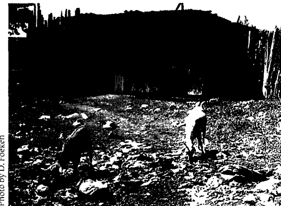
Goats and Cattle roaming for food

A major constraint, as in many other African towns and cities, concerns the lack of enforcement of the existing laws, by-laws and regulations, partly related to a shortage of manpower. Formulating new regulations without the necessary will and power to enforce these regulations is thus a useless exercise.