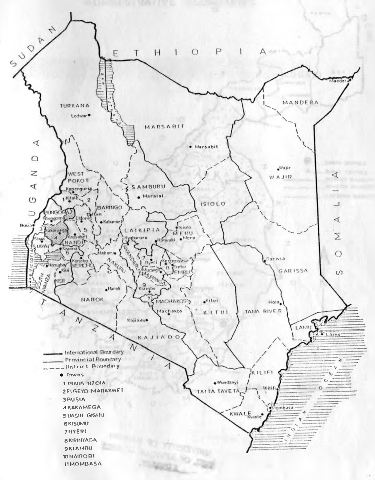
What is the source of these maps. Eq Indicate the source at the bottom