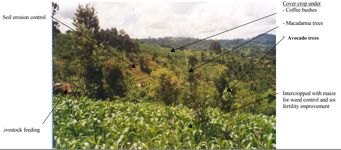
Plate 7. Examples of legume green manure cover crop niches identified by the farmers in Gatanga, central Kenya