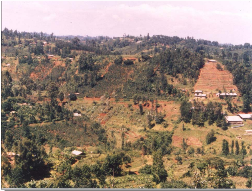
Plate 2. Soil erosion is a serious problem in Gatanga division