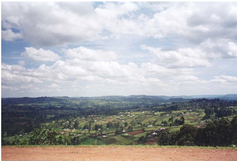
Plate 1. Kisii is one of the most densely populated districts in Kenya

Legumes can play a major role in improving farm productivity in smallholder agriculture as short-term fallow species (Hudgens, 1996). Green manure (GM) legumes can increase plant nutrient supply in the soil (especially nitrogen) and can improve soil physical properties, thereby improving crop yields (Yost and Evans, 1988; Peoples and Craswell, 1992; Muller-Samann and Kotschi, 1994). Legumes can also provide good ground cover, minimizing soil erosion through raindrop impact and runoff (Lal et al. , 1991). Intercropping purple vetch ( Vicia benghalensis ) with maize in central Kenya reduced cumulative soil loss over an eight-month period by three fold compared to bare plots which had 7.1 t ha -1 cumulative soil loss (Gachene and Haru, 1997). In addition, grain legumes are important as a human food source as they are rich in protein, while herbaceous and tree legumes are important livestock feeds (Peoples and Craswell, 1992; Weber, 1996). In 1994 efforts were undertaken to introduce green manure cover crops in Kenya to arrest soil degradation (Dyck, 1997).