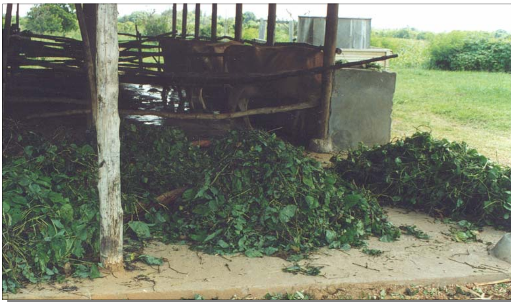
Plate 5. Feeding mucuna forage to Jersey dairy cows at the Mtwapa site

The trial was carried out at KARI-Mtwapa (Plate 5) (Muinga et al. , 2000). Three herbaceous legumes, mucuna, clitoria, and lablab were compared with gliricidia ( Gliricidia sepium ) which is a multi-purpose tree legume recommended for livestock feeding in the region. Sixteen Jersey cows in their second or third month of lactation were divided into four groups balanced for milk yield and parity at the beginning of the experiment. The average daily milk yield per cow per treatment group, one week prior to the start of the experiment was 7.2 kg and the mean live weight was 275 kg (range 235 to 340 kg). During the experimental period, all the cows were fed on Napier grass ad-libitum together with 3 kg maize bran in two equal parts daily. Water was provided throughout. A mineral lick was offered to all the cows. The experimental diets were 8 kg of gliricidia, clitoria, mucuna or lablab in two equal parts daily. The study was conducted for twelve weeks. Data on feed in-take, live-weight change and milk production was collected.