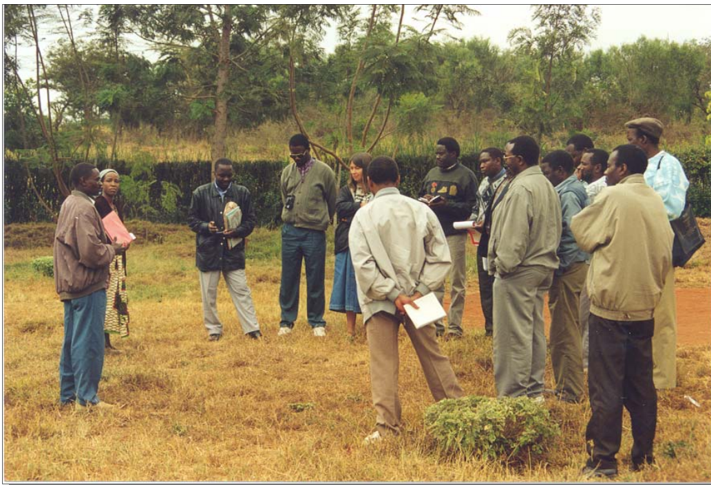
Plate 3. LRNP monitoring team in Machakos