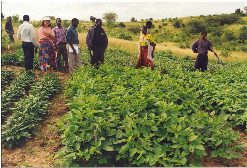
Plate 4. On-farm screening of cowpea varieties in coastal Kenya at Mtwapa

A total of 52 cultivars obtained from IITA were evaluated for adaptation, leaf and grain yield and maturity period (Plate 4). It was found that the local cultivars were more productive in terms of leaf yield which called for screening efforts towards high grain yield rather than leaf yield (Muli and Saha, 2000). Eight out of the 52 cultivars were selected for further evaluation on-station and seven for on-farm testing. The eight cultivars were IT95K-1380, IT93K-273-2-1, IT95K-1156-3, IT93K-2046-2, IT93K-734, IT93K-2045-29, K80, and IT90K-284-2. In both on-station and on-farm trials the grain yield of the different cowpea cultivars did not differ significantly. The mean grain yield for the on-station trial ranged from 1.64 to 2.51 t ha -1 . Cultivar IT93-2045-29 gave the highest yield (2.8 t ha -1 ) followed by IT93-2046-2 (2.4 t ha -1 ). On-farm mean grain yield ranged from 0.30 t ha -1 for the cultivar IT93K-273-2-1 to 1.30 for cultivar K80. A field day was held primarily for farmers to evaluate the cultivars using their own criteria. The following cultivars were preferred K80; IT95K-1156-3 and IT90K-284-2.