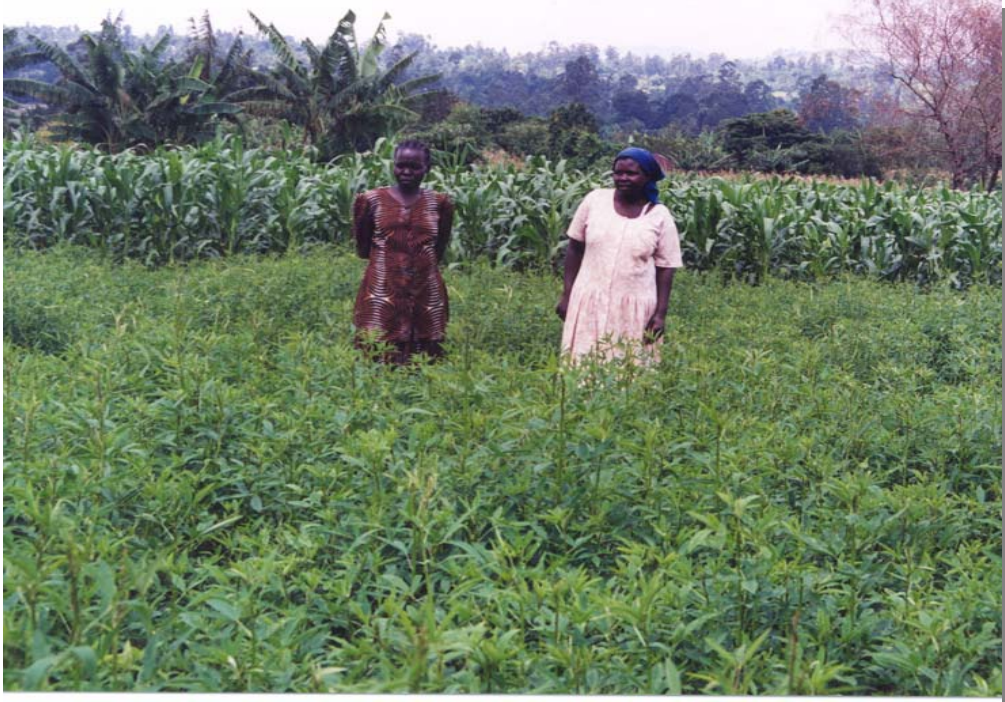
Plate 6. Farmers in Kakamega on-farm site. * It only costs very little to return land back to productivity using Sunnhemp ( Crotalaria ochroleuca ) fallow