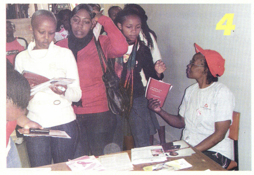
4. Students receive breast cancer education materials at the Main Campus in an event organized by students.

3. Starkey Foundation and professionals from the School the Department of Surgery fit hearing aids to beneficiaries.