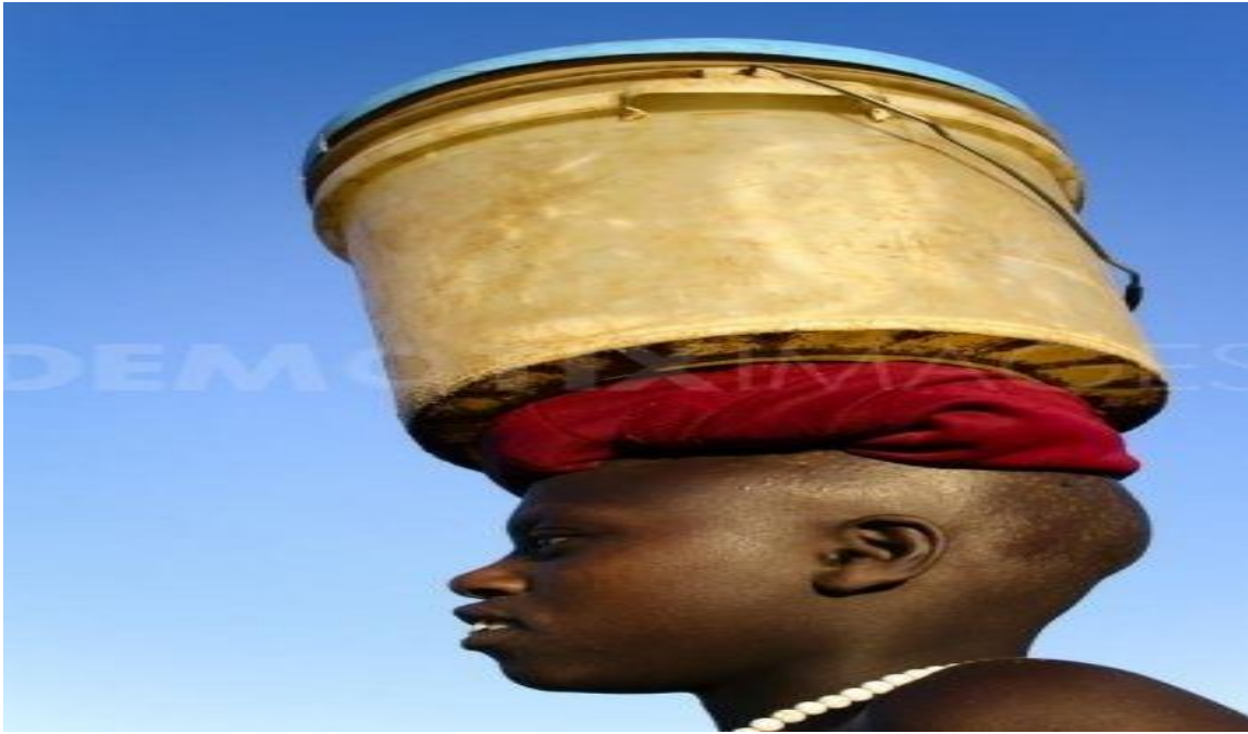
Photo 5.6. a young girl carrying water on her head.