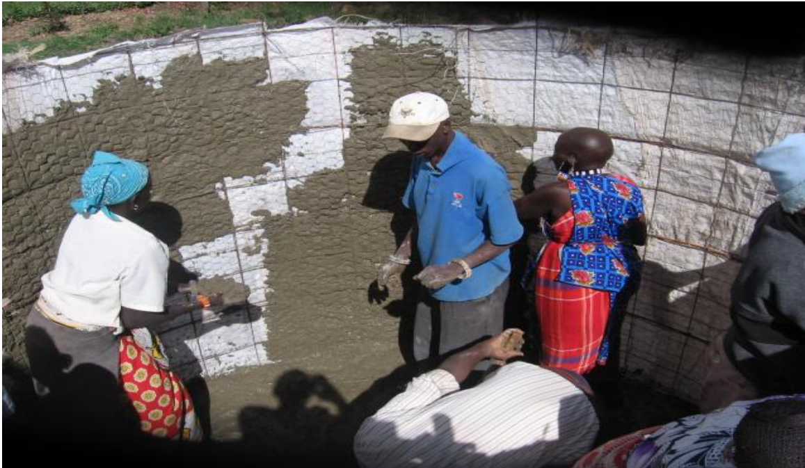
Photo 5.2 : Training Maasai Women and Building Rainwater-Harvesting Tanks in the Maasai Regions of Ngong and Kajiado Kenya.