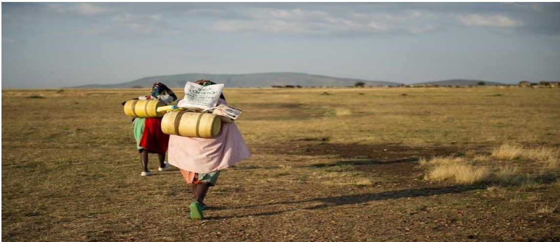
Photo 5.4: Girls, fetching water and helping. At the age of nine, it is not uncommon for them to marry.