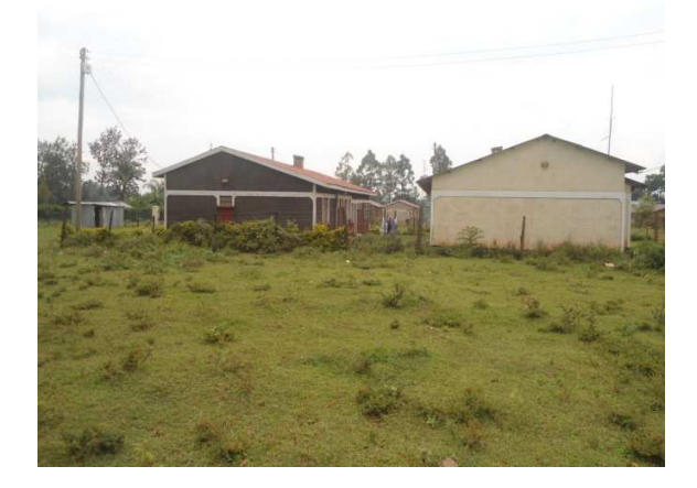
Figure 4.3: Afya SACCO housing at Amalemba estate