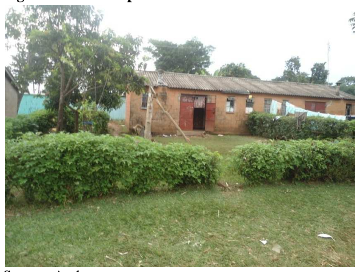
Figure 4.11 Municipal Council house in Mudiri estate.

In the town, there are some houses which used to be permanent decent, self contained houses but due to lack of maintenance, their condition has since deteriorated. These units range from single room to one bedroom to two bedroom houses inhabited by the low income earners. Some of them are municipal council houses, state corporations like postal corporation's houses and some civil servant government houses although government houses are currently under renovation program. Their plumbing system failed, the tenant could not pay for basic services like water and electricity so the services had been long disconnected because of pending bills. Such houses fall under protected tenancy stipulated by Rent Restriction Act and rent increase has been restricted by the same law. The rent charged has remained as low as ksh.2000 to ksh.500 for single rooms, ksh.1000 to ksh.1500 for one bedroom houses and ksh.2000 for two bedroom houses. Some of these houses have been taken over by middle income working class who are avoiding paying market rent in middle income estates and have reconnected electricity and water services.