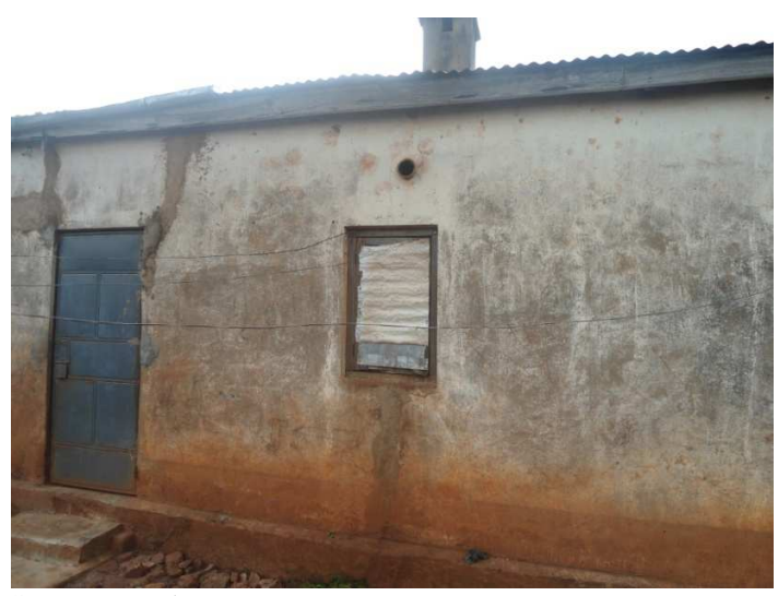
Figure 4.12: Low Grade Civil Servant House in Mudiri estate.