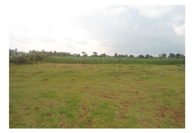
Figure 4.2: Land for housing development next NHC flats.